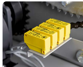
Non-Contact Proximity Sensors