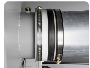
Interlocking Air Seals