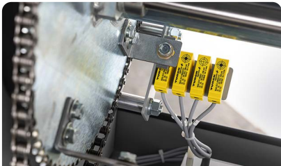
Non-Contact Proximity Sensors